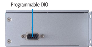
▲ Bottom view (Non-PoE SKU)